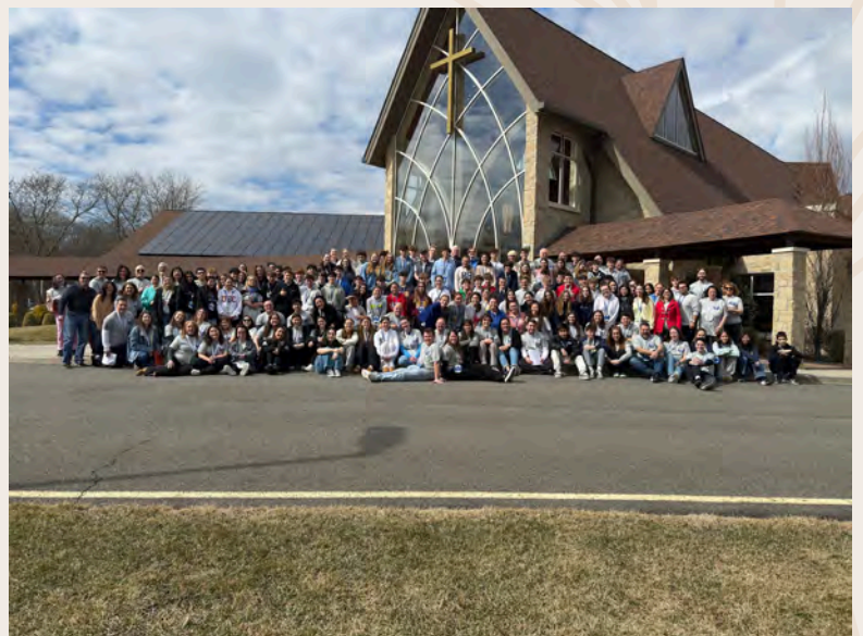
'HOME SWEET HOME' MARCH 7-9, 2025