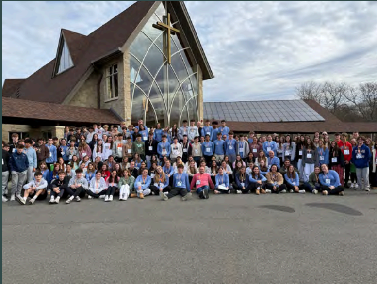
'ONE FLOCK, ONE SHEPHERD' NOVEMBER 8-10, 2024

Rebranded for 2024, the Discipleship Weekend Retreat (formerly Freshman/Sophomore), is a dynamic retreat experience for all high school teens. This high energy retreat experience is prepared and lead by our upperclassmen high-school Peer Ministry TEAM and select group of Sophomore TEAM Apprentices. This retreat is held at our Parish Center each year in November: themes and activities change from one year to the next.